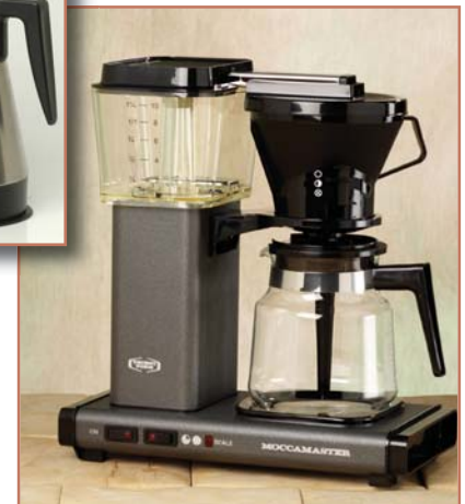
Technivorm Model KB 741 with glass decanter ▶