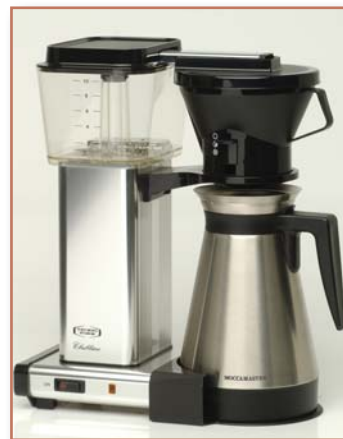
◀ Technivorm Model KB 741 with thermal carafe

To learn more about Technivorm brewers or to purchase one, visit the website: http://www.technivorm-us.com/ .